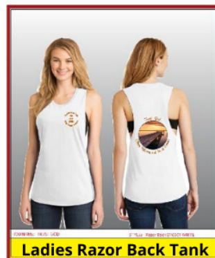
Ladies Razor Back Tank

2022 Sunshine of the Spirit - High Desert Convention T-Shirts M, L, XL = $17.00; 2XL = $19.00; 3XL = $20.00; 4XL = $22.00 Preorders will be available for pickup at the convention. Limited quantities for sale during the convention.