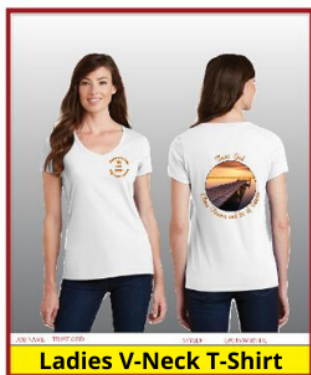
Ladies V-Neck T-Shirt