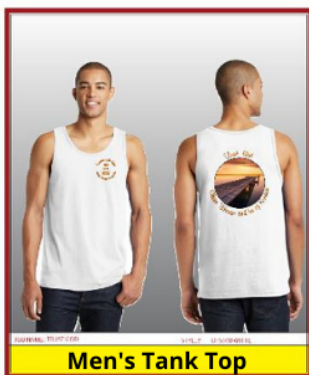
Men's Tank Top