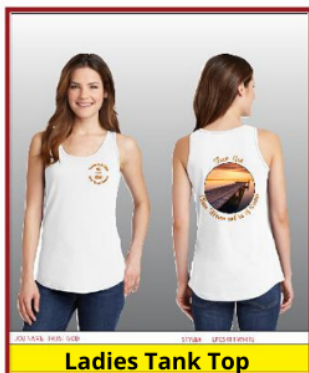
Ladies Tank Top